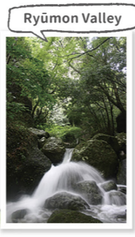
Beautiful valley that has been selected as one of the 100 most famous Japanese waters and Japanese forest water sources!