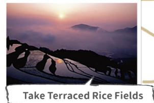
Take Terraced Rice Fields The Rice Fields of Take are widening at the valley of the Mt. Kunimi, marking the prefectural border to Sasebo City.