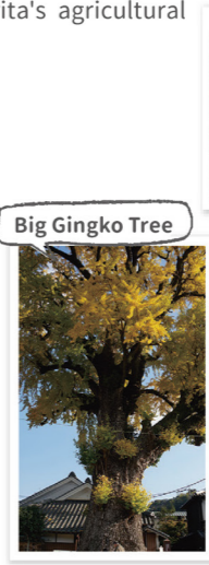
Age: about 1000 years old Height: 30.5m National Natural Treasure