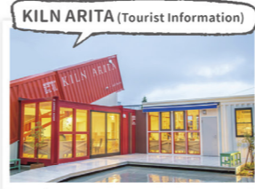
KILN ARITA (Tourist Information)