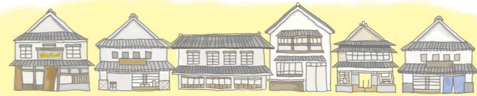
Name : Preservation District for Groups of Historic Buildings Arita Uchiyama Division : Important Preservation District for Groups of Historic Buildings

At the beginning of the 17th century, Arita, the first place in Japan where the porcelain industry succeeded, was under direct control of the feudal clan of Saga. The center of Arita was called "The 1000 houses of Arita". In 1828 a big fire destroyed large parts of the town and the present townscape was rebuilt on the remaining foundations. This townscape was selected as an Important Preservation Districts for Groups of Historical Buildings.